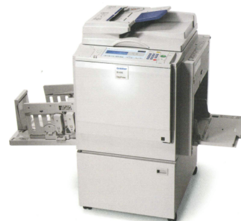
CopyPrinter DX 4545